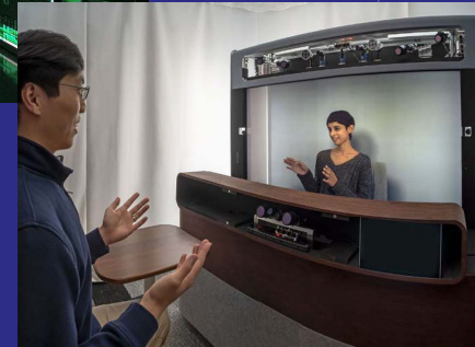
Google starline concept